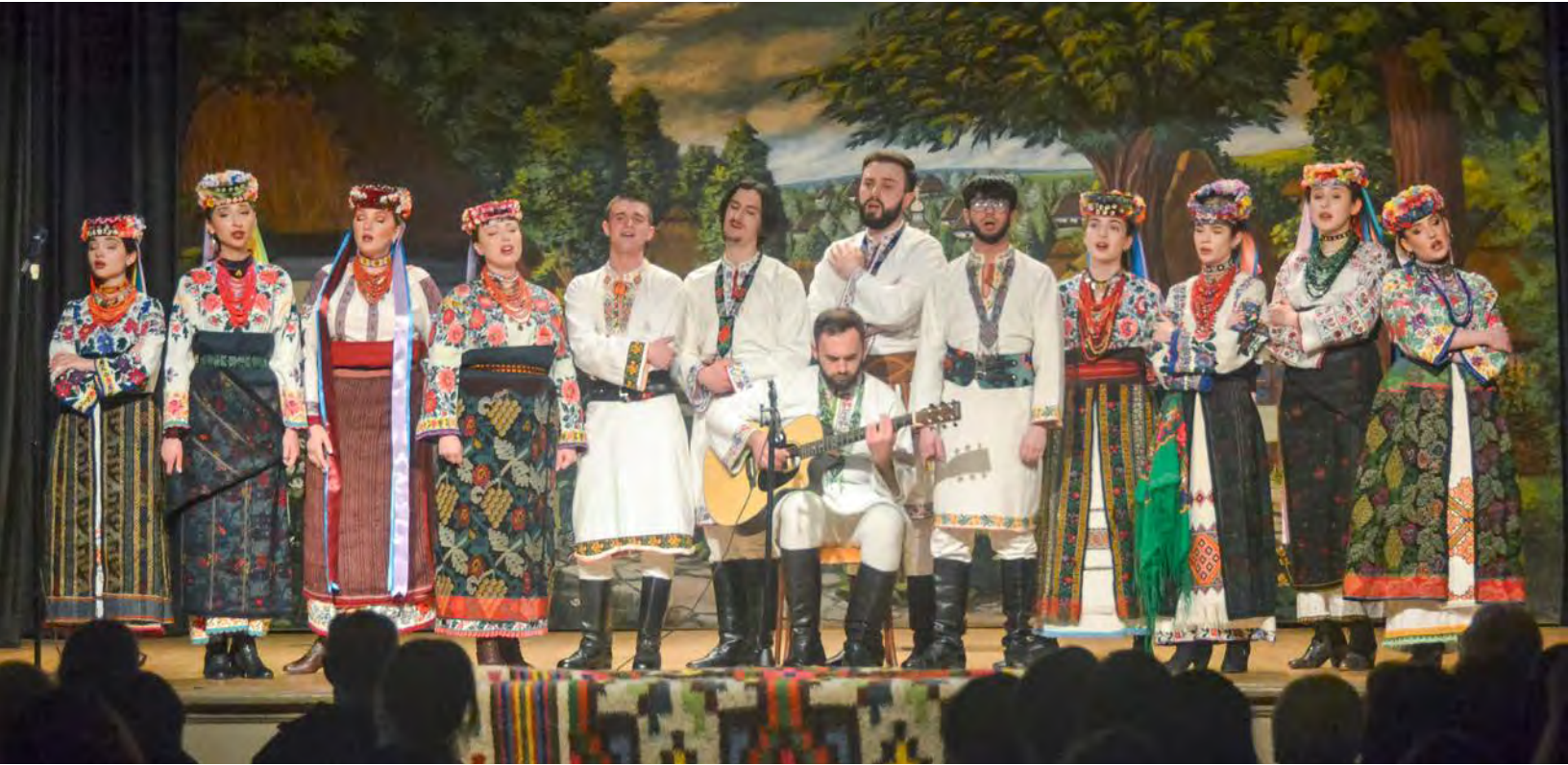
Gerdan Concert, March 13, 2024